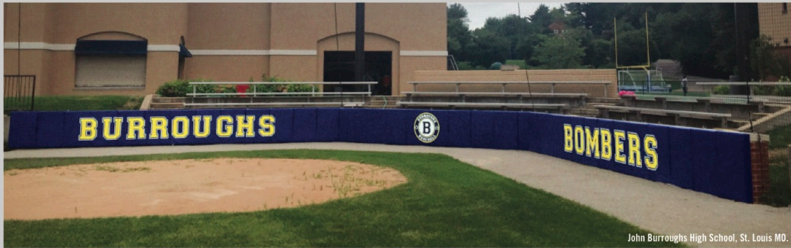
John Burroughs High School, St. Louis MO.